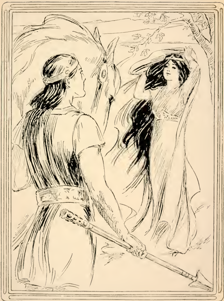
"Standing before him was the little princess" Page 169